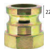
System 22 (for all type-sizes except 42)