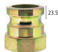
System 23.5 (only at type-sizes 35 and 50!)